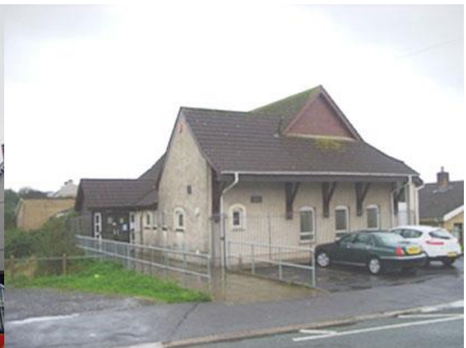
Llanerch Community Centre