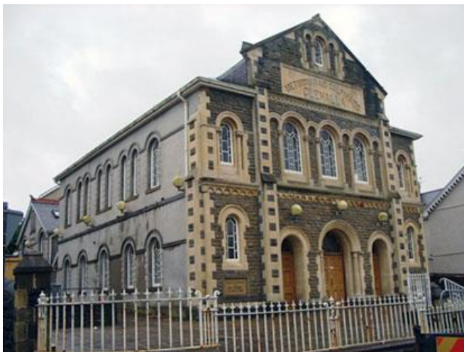
Glenalla Community Centre

The Council owns and manages seven community centres providing subsidised facilities for use by the public of all ages.